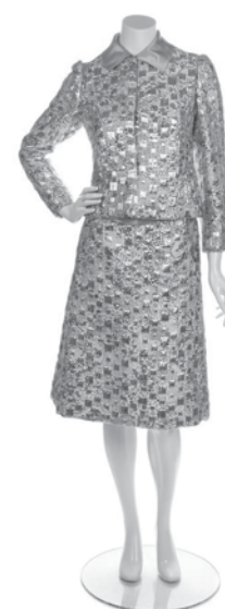
A Scaasi peach patterned skirt ensemble is comprised of a long-sleeve jacket with gold metallic square motif and front snap closure, a matching straight skirt with a back zip closure. The ensemble is completed with a sleeveless peach silk blouse with gathered pleats at the waist.