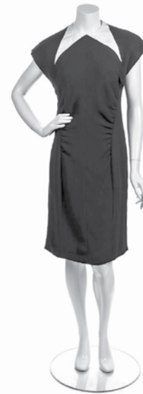
A 1997 Comme des Garçons gray cotton dress features a silk floral overlay. Size S.

According to James, the Historic Costume Collection has more than 2,000 objects. He said the collection plays an important role in supporting research and teaching in the department. The plan is to show new acquisitions in the Gallery every other year.