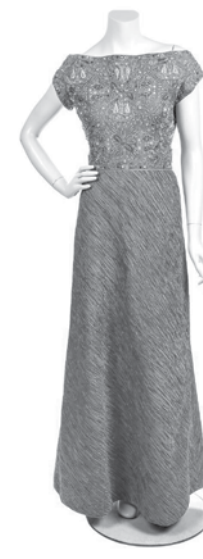
Labeled Mary McFadden Couture, this coral gown features an embroidered and bead embellished bodice and a back zip closure. Size 10.