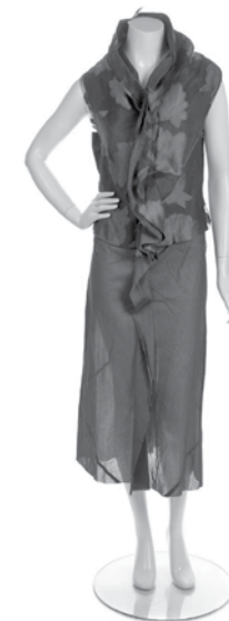
This Geoffrey Beene black dress has cap sleeves, a cream geometric embellishment at the neckline and a back zip closure. Size 10.