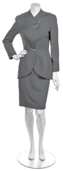
A Thierry Mugler royal blue wood skirt suit features a long-sleeve jacket with an asymmetric front closure and decorative oblong silver tone buttons. The jacket pairs with a straight skirt with a back zip closure. Size 40.