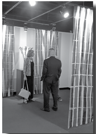
Visitors meander and chat among the hanging panels featured in the Vox Stellarum installation in the newly renovated Hillestad Textile Gallery. The Gallery was closed for a month this past spring for the major renovation project.