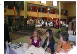
TCD Merchandising students at Kearney Apparel Market

TCD Merchandising students assisted Nebraska apparel store owners in making decisions and placing orders for Fall and Holiday 2007 at the Kearney Apparel Market March 19, 2007.