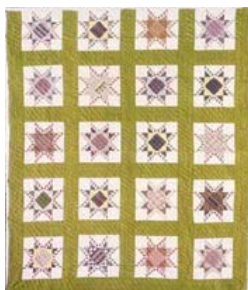
Feathered Star, circa 1880-1900, maker unknown, USA, 77" X 65.5"