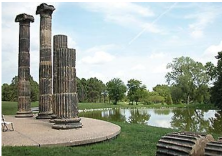
PIONEER PARK AND NATURE CENTER