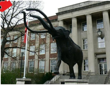
UNIVERSITY OF NEBRASKA STATE MUSEUM