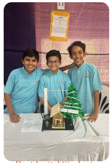
Residential Students on Science Day