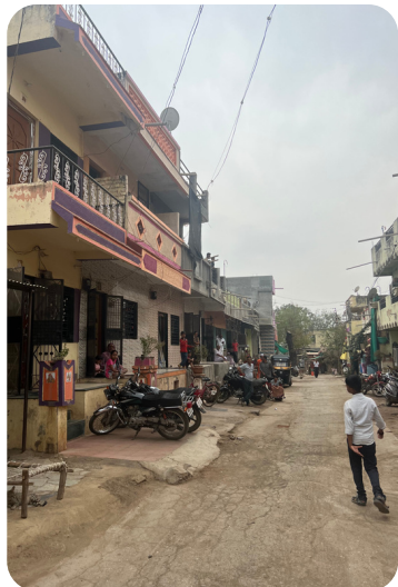
A Small, Local Village Interns Visited on a Home Visit