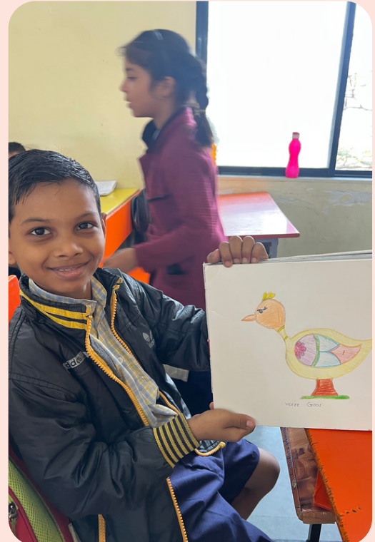
Drawing Made by an Intern & Class 4 Student