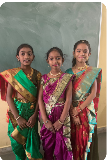
Students at the Anubhuti City School Celebrating a Festival

The Department of Child, Youth, & Family Studies will begin advertising the internship, and recruiting applicants around a year in advance. Applications will then open at the beginning of the fall semester. Interviews and informational meetings will follow, and decisions will be made before the end of the fall semester. Follow-up meetings and an onboarding process will take place after final decisions to ensure interns are well prepared for their experience abroad.