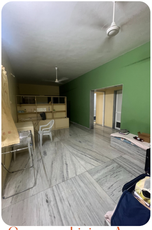
Common Living Area in the Girl's Hostel

Ants are a common problem in the hostel. Interns should keep snacks and dirty laundry sealed as these were common problem-areas that ants were attracted to on past trips.