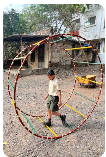
Student Playing at the Anubhuti City School