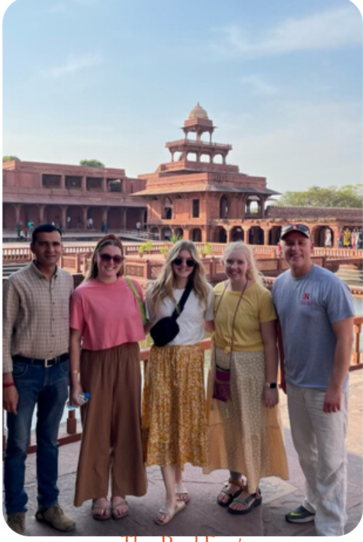
The Red Fort