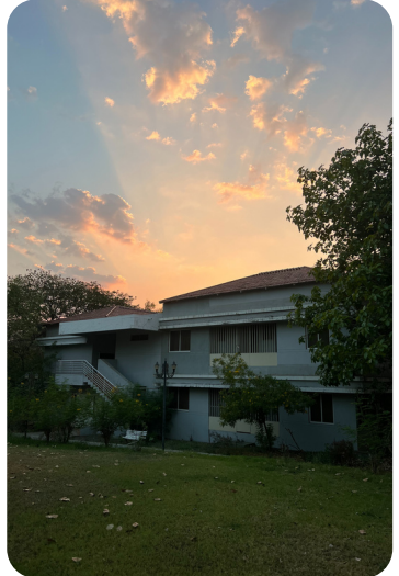
5th–8th Grade Girl's Hostel