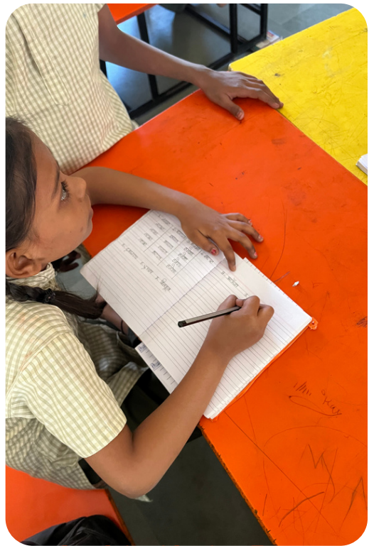
City School Student Taking Notes During Hindu Class

Living in the U.S., interns may be accustomed to a rigid schedule and expected to be prompt for scheduled activities. This may not always be in the case while in India. Interns should be flexible and patient with scheduled and unscheduled events and activities.