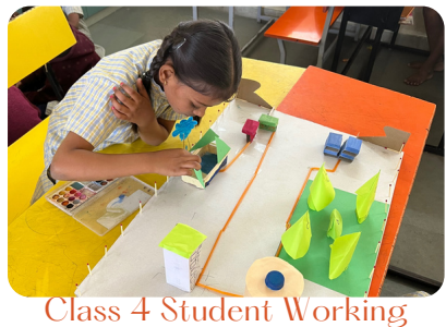
on a Science Project

Discipline at the Anubhuti City School can be uncomfortable and difficult to witness or process, but it is the intern's role to observe and learn, not to judge or interfere.