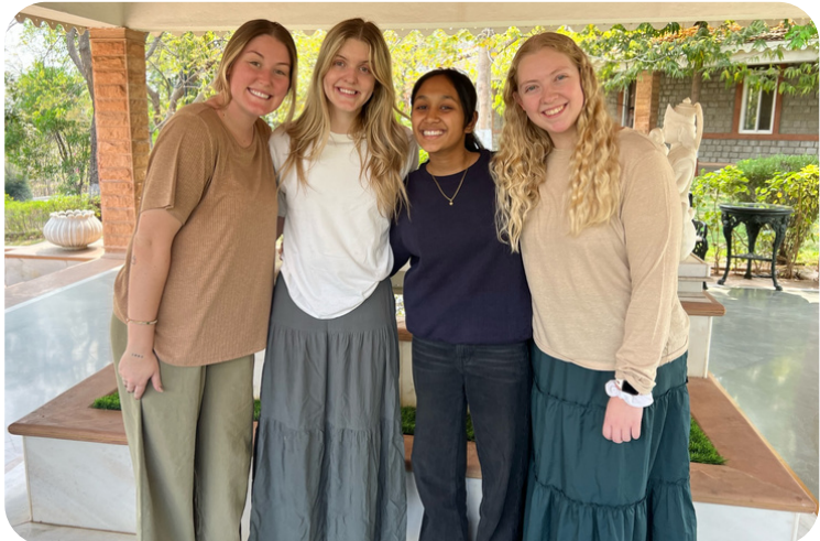
Typical Outfits Worn by Interns