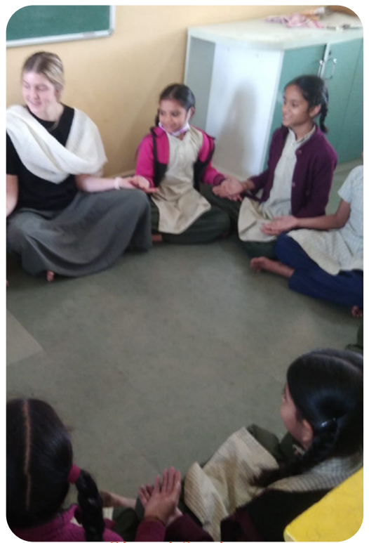
Class 4 Students Participating in a Game

Most time in the classroom will be spent observing and learning about the cultural differences in education systems; however, both students and teachers will occasionally ask you to teach. Suggestions for teaching materials include interactive games (ex. Down by the Banks), action songs (ex. The Hokey Pokey), dances, poems (ex. Peter Piper), stories (ex. Three Billy Goats Gruff), or other small lessons.