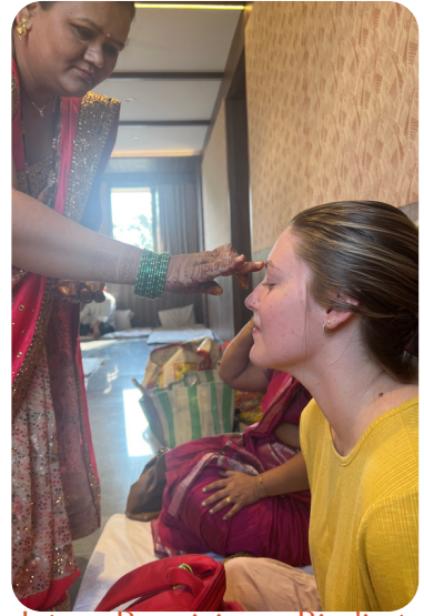
Intern Receiving a Bindi at a Traditional Ceremony