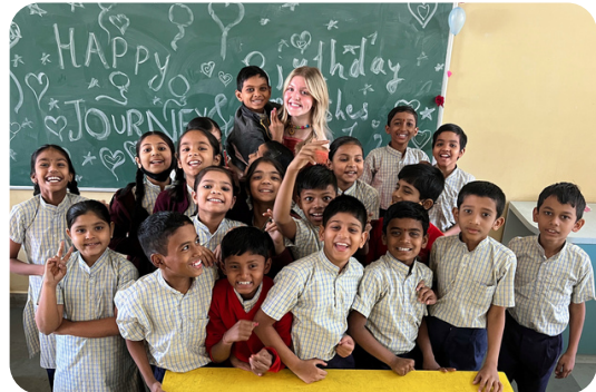
Anubhuti City School Students Celebrating the Birthday and Departure of an Intern

This is a life-changing experience that allows interns to grow personally, professionally, and culturally. Each person will gain a unique perspective that they can apply in their future professions and carry with them throughout life. Not only will interns form lifelong friendships with one another after enduring an emotionally rewarding experience, but interns will also create international bonds with teachers and students they meet along the way.