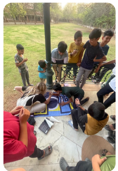
Interns Playing Yard Games with Students

The safety of the interns is a main priority to both the CYAF Deparment and Jain Irrigation/Anubhuti. If interns want to arrange an outing, such as a trip to the local store (D-Mart) for snacks or a weekend activity, they must be accompanied by a chaperone. The interns' 'hostel parent' will most likely be the one to accompany them, so it is important to communicate and find a time that works in their schedule. While interns are out, they should be prepared for people to stare and take pictures. Interns will most likely be approached and asked to take pictures, but it is acceptable to politely decline if they are uncomfortable.