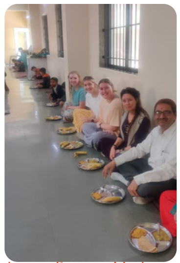
Interns Eating a Meal at the Anubhuti City School