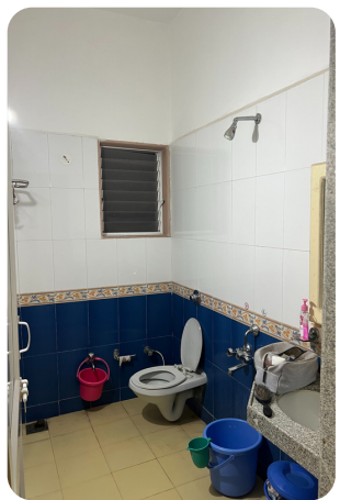
Bathroom in the Girl's Hostel