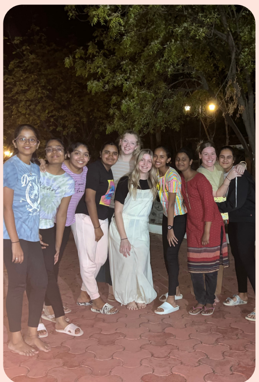
Interns Saying their Goodbyes to Residential School Students