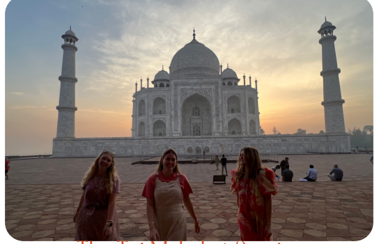
The Taj Mahal at Sunrise

It is important for interns to recognize and acknowledge the emotional difficulty of this experience, but also to embrace the impact they were able to make on many lives!