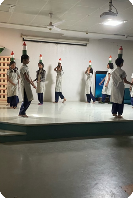
City School Students During Dance Class