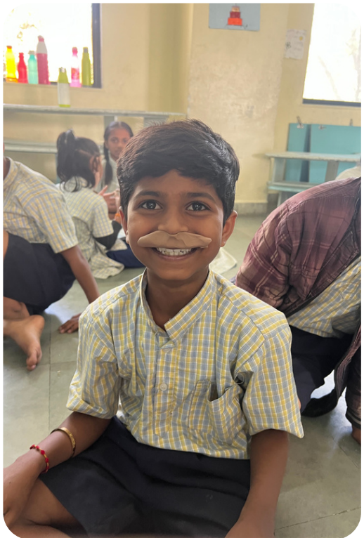
Class 3 Student Playing with Clay