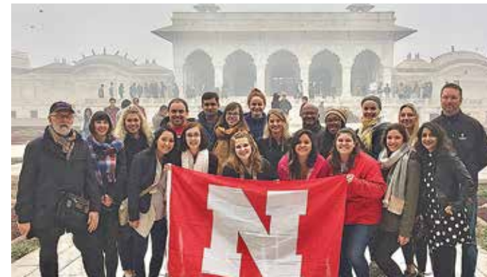
TMFD-HRTM Joint India study tour group at the Red Fort in Agra

in Delhi – India's capital and the seat of its federal government. A diverse and cosmopolitan city of 18 million people, it's a sprawling and interconnected network of urban neighborhoods and enclaves bordered by high walls and ringed by crowded modern expressways. Extremes of wealth and poverty are evident everywhere in India, no place more so than in Delhi, a city as crowded, noisy, polluted and exhausting as any of the world's global crossroads. The group visited the Jama Masjid mosque in Delhi's Old City, and the Qutab Minar, another World Heritage Site and mosque complex. Delhi is a "shop 'til you drop" city and both an immense modern shopping mall and "Dilli Haat", an open-air market featuring crafts and artisans from all over India, were on the group's agenda. The Delhi portion of the trip concluded with a tour and lunch at the Leela Palace Hotel, one of that Indian hotel chain's premiere properties, located close to New Delhi's Diplomatic Enclave. Learning more about the hospitality industry was a special "perk" of the trip for the TMFD contingent, and for the HRTM students and faculty, the blending of textiles and tourism provided a unique experience of hedonic harmonization.