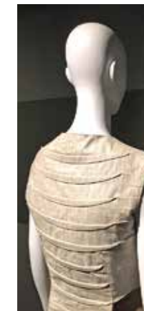
You Are What You Wear (detail view of the back) by Samirah Alotaibi