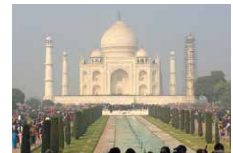
The Taj Mahal is one of the world's greatest tourist attractions, with thousands visiting every day.