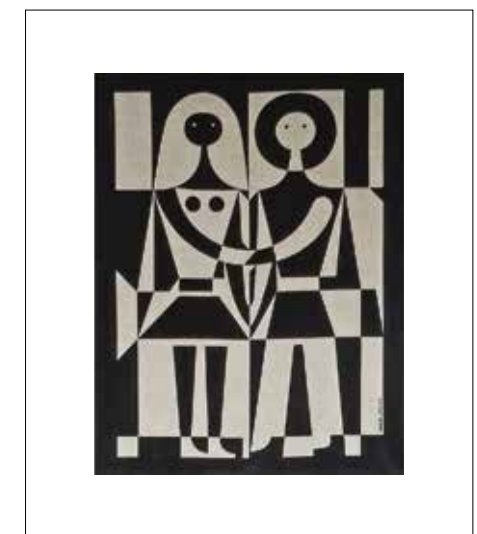
Alexander Girard wall hanging, black and white couple, 1972; screenprint on linen. TMFD Historic Textiles Collection.