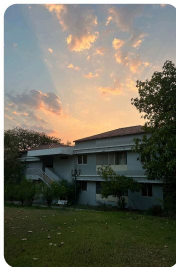
5th-8th Grade Girls Hostel