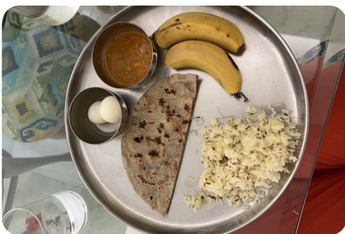
Common Foods Eaten at Jain Hills and the Anubhuti Residential School

Interns should be mindful of the portions they take at meals. The food can be spicy, so it is best to first try foods and then go back for seconds. It is an important aspect of the school that food is not wasted. Students and staff will be aware if there is food left on plates. If there is too much food remaining, interns, along with students, may be asked to finish what is left on their plates before they are allowed to clean it off.