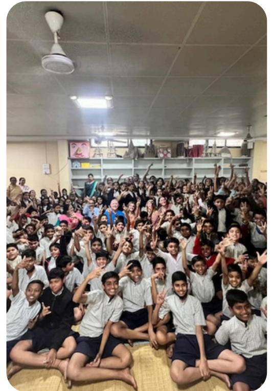
Students, Teachers, & Interns at the City School

Wifi connection will be limited and will vary in terms of availability. The Anubhuti Residential School will set interns up with wifi access; however, it will only be available in the staff room during school hours (including Saturday and Sunday). Due to this, interns may also want to consider an international data plan. (ex. Through Verizon, an international data plan costs $100 USD/month.) Internship supervisors, Anubhuti teachers, and UNL professors will communicate through WhatsApp, so a phone plan allows for reliable communication.