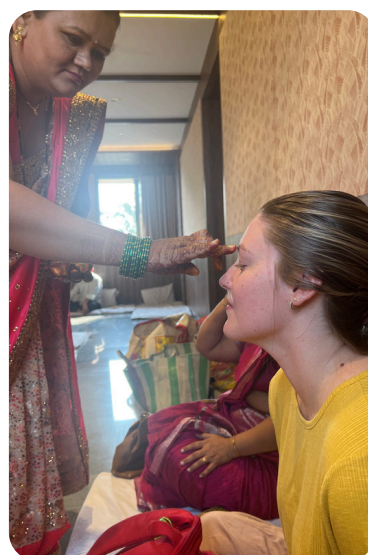
Intern Receiving a Bindi at a Traditional Ceremony