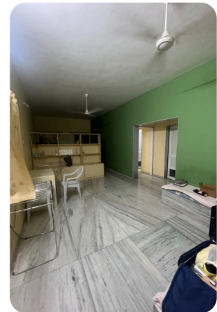
Common Living Area in the Girl's Hostel

Ants are a common problem in the hostel. Interns should keep snacks and dirty laundry sealed as these were common problem-areas that ants were attracted to on past trips.