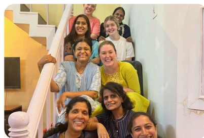
Interns Dining at a Teacher's Home