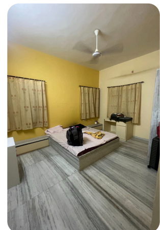
Bedroom in the Girl's Hostel