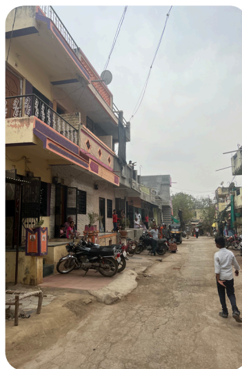
A Small, Local Village Interns Visited on a Home Visit