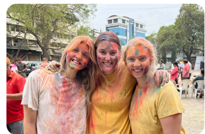
Interns Participating in Holi Festival