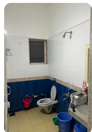
Bathroom in the Girl's Hostel