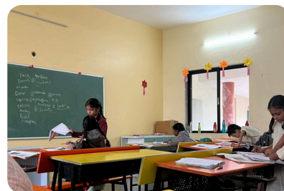
Typical Classroom at the City School