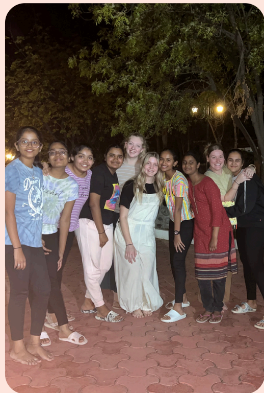
Interns Saying their Goodbyes to Residential School Students