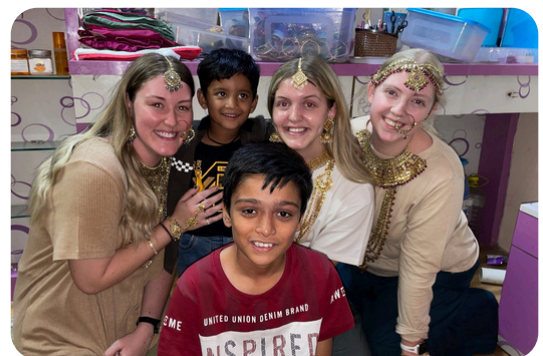
Interns Dressed in Traditional Wedding Jewelry on a Home Visit