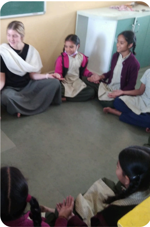
Class 4 Students Participating in a Game

Most time in the classroom will be spent observing and learning about the cultural differences in education systems; however, both students and teachers will occasionally ask you to teach. Suggestions for teaching materials include interactive games (ex. Down by the Banks), action songs (ex. The Hokey Pokey), dances, poems (ex. Peter Piper), stories (ex. Three Billy Goats Gruff), or other small lessons.