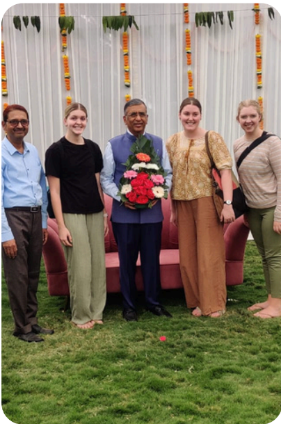
Interns Celebrating the Birthday of the Jain Hills Chairman