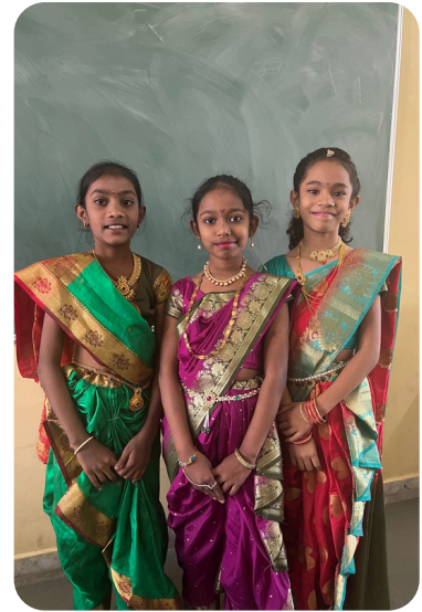
Students at the Anubhuti City School Celebrating a Festival

The Department of Child, Youth, & Family Studies will begin advertising the internship, and recruiting applicants a year in advance. Interviews and informational meetings will follow. Follow-up meetings and an onboarding process will take place after final decisions to ensure interns are well prepared for their experience abroad.