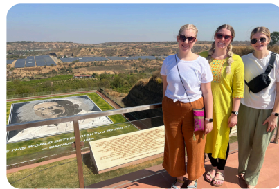
Memorial for the Former Chairman