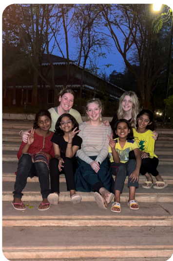
Interns with Class 5 Students

Interns will have lots of time to interact with the students at the Residential School which means that many relationships will be formed here. Interns will eat most of their meals at the school, so they should be sure to spend time sitting with and getting to know the students. Interns will also have the opportunity to participate in after school activities such as track, basketball, football, and more. On the weekends and during evening free-time, students will want to spend time with and talk to interns to build friendships and learn about their lives. Boys and girls may not enter one another's hostels.