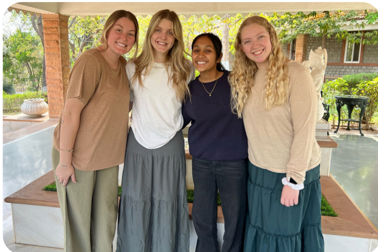
Typical Outfits Worn by Interns