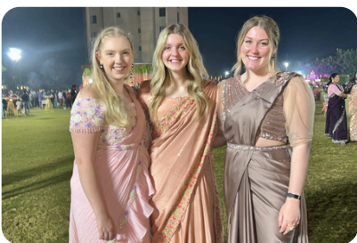
Interns Attending a Wedding in Traditional Clothing

During their 6-8 week stay, many of the Anubhuti City School teachers will invite interns for home visits or other fun activities and experiences. Past experiences have included shopping for local Indian clothing and jewelry, learning how to make a home-cooked Indian meal, attending a wedding, or participating in the Holi festival. Interns should be proactive about communicating and planning these opportunities.