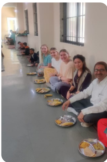
Interns Eating a Meal at the Anubhuti City School