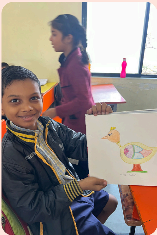
Drawing Made by an Intern & Class 4 Student