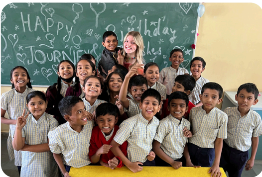
Anubhuti City School Students Celebrating the Birthday and Departure of an Intern

This is a life-changing experience that allows interns to grow personally, professionally, and culturally. Each person will gain a unique perspective that they can apply in their future professions and carry with them throughout life. Not only will interns form lifelong friendships with one another after enduring an emotionally rewarding experience, but interns will also create international bonds with teachers and students they meet along the way.