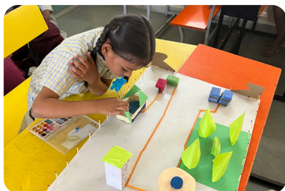
Class 4 Student Working on a Science Project

Discipline at the Anubhuti City School can be uncomfortable and difficult to witness or process, but it is the intern's role to observe and learn, not to judge or interfere.