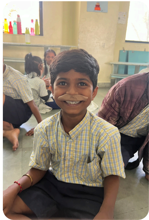
Class 3 Student Playing with Clay