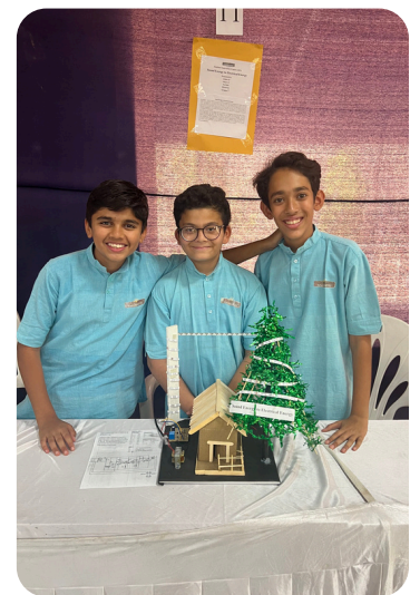
Residential Students on Science Day