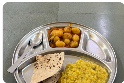
A Typical Meal at the Anubhuti City School