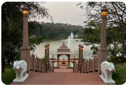
Lake at the Jain Hills