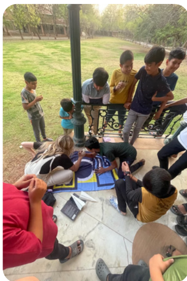
Interns Playing Yard Games with Students

The safety of the interns is a main priority to both the CYAF Department and Jain Irrigation/Anubhuti. If interns want to arrange an outing, such as a trip to the local store (D-Mart) for snacks or a weekend activity, they must be accompanied by a chaperone. The interns' 'hostel parent' will most likely be the one to accompany them, so it is important to communicate and find a time that works in their schedule. While interns are out, they should be prepared for people to stare and take pictures. Interns will most likely be approached and asked to take pictures, but it is acceptable to politely decline if they are uncomfortable.