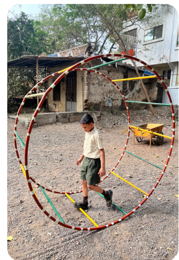
Student Playing at the Anubhuti City School