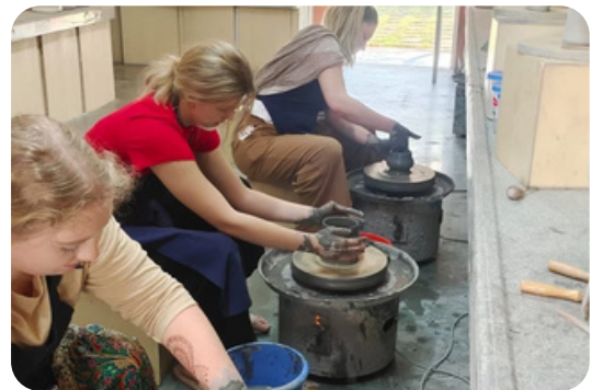
Interns Learning Pottery at the Anubhuti Residential School