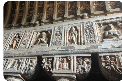
Carvings Inside a Cave