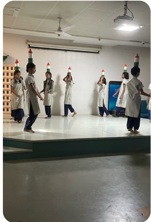
City School Students During Dance Class