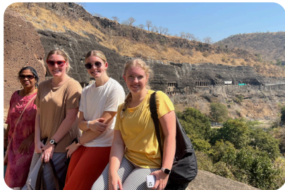
Interns at Ajanta Caves

The Ajanta Caves , located in Ajanta, Maharashtra (about a 2-hour drive from the Anubhuti Residential School), is a group of painted and sculpted caves depicting Buddhist beliefs. This is a UNESCO World Heritage Site full of historical significance. This excursion will be arranged by Jain Irrigation. Admission for interns will be covered by Jain Irrigation and interns will be accompanied by a teacher from the Residential School. At the end of the tour, there will be an opportunity for shopping and dining.