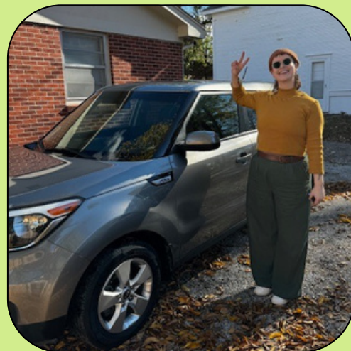
introducing: Kenneth the Kia!