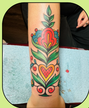
They got a new tattoo!

beep beep ribby ribby! Jules got a new car! It feels so good to have reliable transportation again!!!