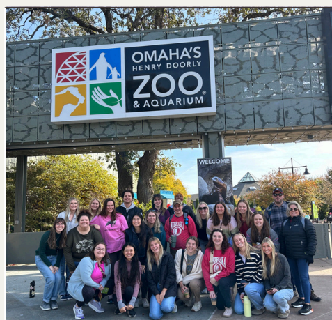
School Psychology 2024