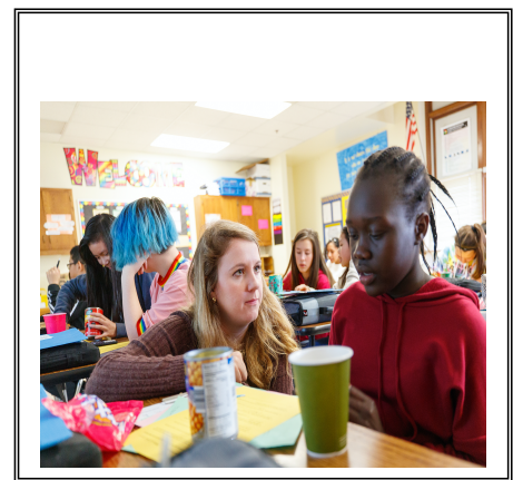
Figure 3: Phases of Student Teaching

During Phase 2, the student teacher will work collaboratively with the cooperating teacher to assume increasing responsibility for learning. This process can occur in a variety of ways. The student teacher can be integrated into instruction by working with individual students or groups of students as a part of the cooperating teacher's lesson plan. Other activities that allow student teachers to use their capabilities are maintaining attendance records, grading student work, leading a portion of a lesson, and co-teaching. (See Figure 3: Phases of Student Teaching)